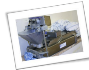
The Doughnut Robot