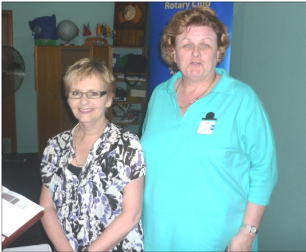
Whyalla's answer to Cath & Kim