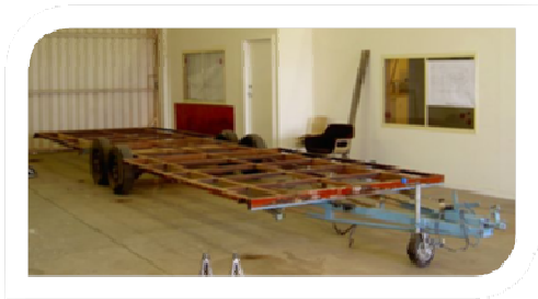
The Mobile Catering Unit after the first week-end of work. Three weeks ahead of schedule.